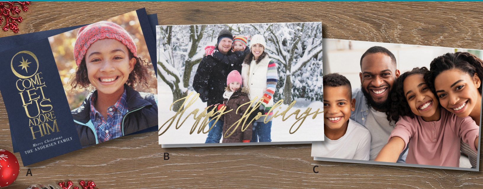
PHOTO HOLIDAY CARDS