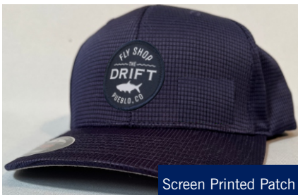
Screen Printed Patch

Standard Merrow edge colors at no charge: Black, White, Brown, Gold, Red, Navy, Royal, Purple, Pink, Grey.