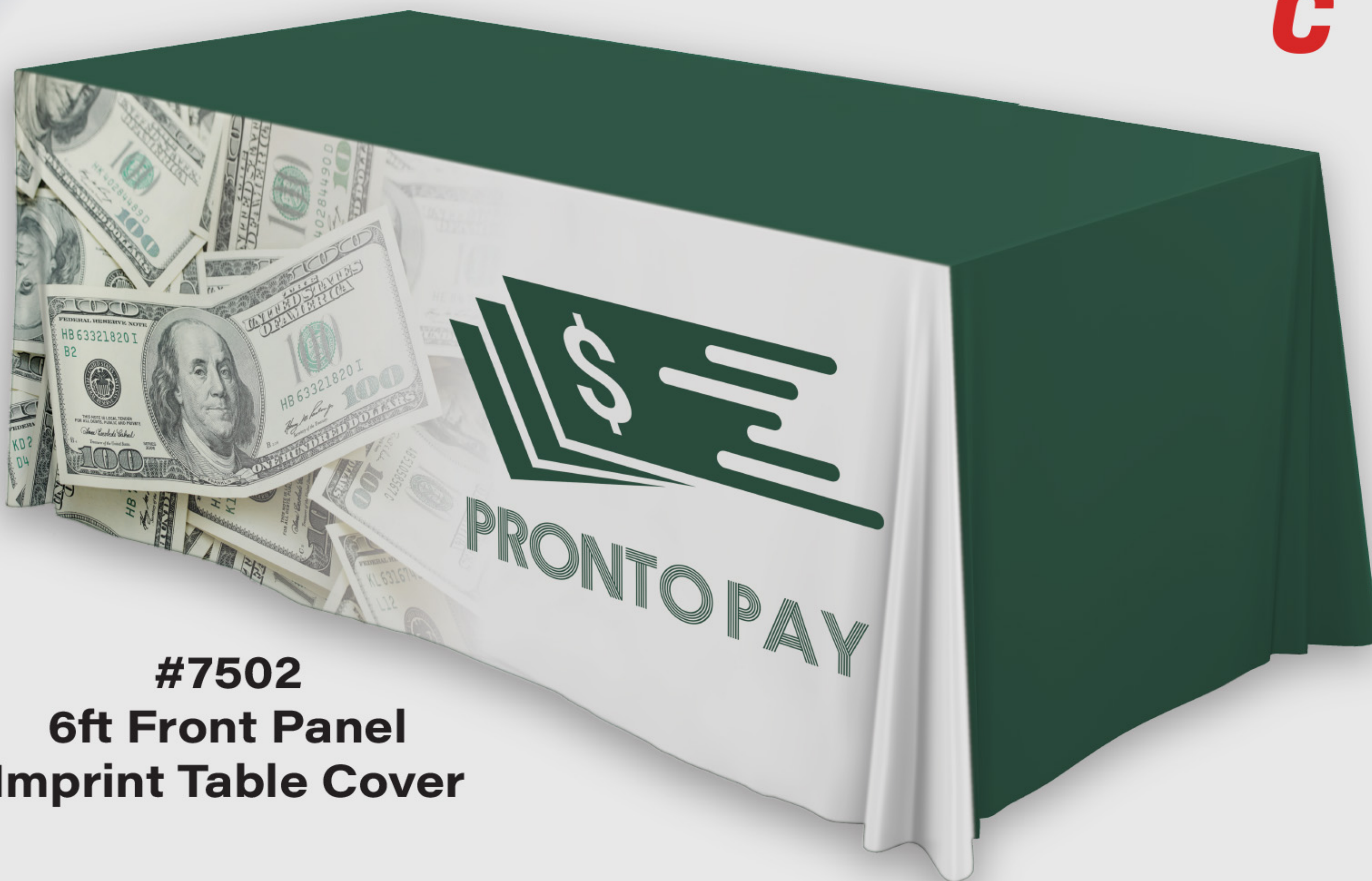
#7502 6ft Front Panel Imprint Table Cover