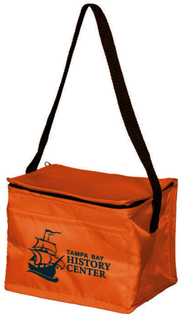
QSB290 $2.77(R)/100-pcs Min.