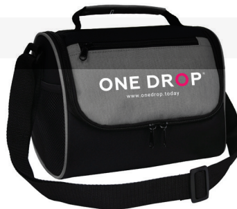
QSB202 | HOLDS 8 CANS $9.03(R)/50-pcs Min.