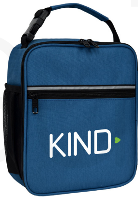
QSB200 | HOLDS 12 CANS $13.55(R)/50-pcs Min.