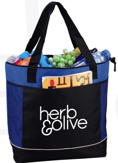
QSB221 | HOLDS 38 CANS $13.55(R)/50-pcs Min.