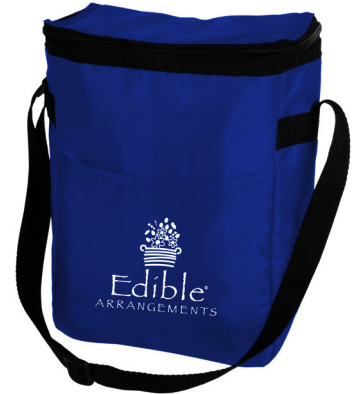
QSB107 | HOLDS 12 CANS $5.10(R)/100-pcs Min.