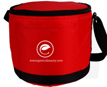
QSB108 | HOLDS 6 CANS $4.60(R)/100-pcs Min.