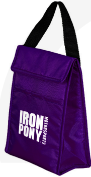
QSB291 $3.35(R)/100-pcs Min.