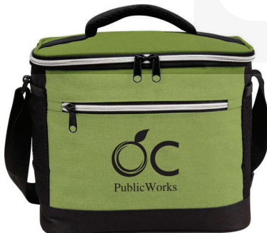
QSB201 | HOLDS 12 CANS $11.08(R)/50-pcs Min.