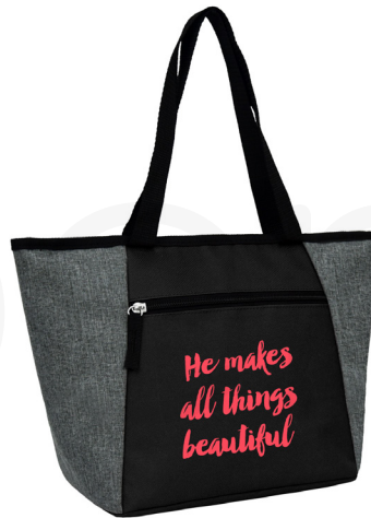
QSB220 | HOLDS 12 CANS $9.23(R)/100-pcs Min.