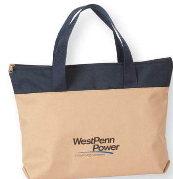
DERBY ZIPPER TOTE TB1875