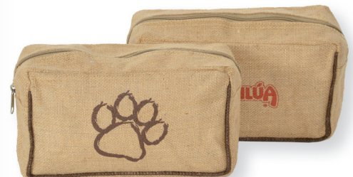
MAUI JUTE/BURLAP ACCESSORY BAG IB835