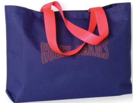
MONTEREY TOTE BAG TB2114