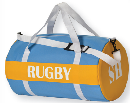
RUGBY FIELD SPORTS BAG BB2413

Approximate dimensions 24 x 13 x 13" h Imprint areas: Front 14 x 2.5", Ends 8 x 8"