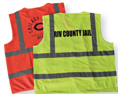
HIGH VISIBILITY SAFETY VEST ISV003