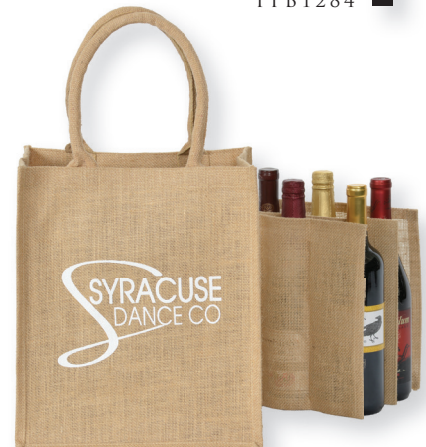
NAPA 6 BOTTLE WINE TOTE ITB1284