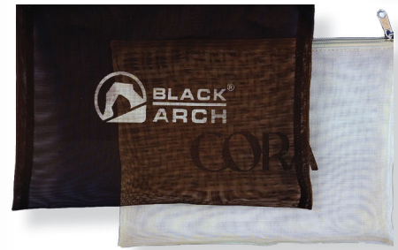
SKYWAY ZIPPERED ACCESSORY BAG BC1180