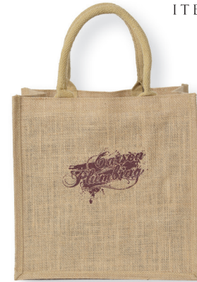
COZUMEL MEDIUM LAMINATED BURLAP TOTE BAG ITB1212