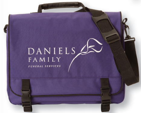
PARK AVENUE FLAP OVER BRIEFCASE BC9140

Approximate dimensions 16 x 3.75 x 12" h Imprint area 10 x 7" h