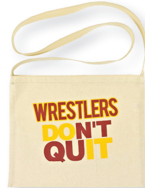
MUSETTE NATURAL COTTON SHOULDER BAG TB145

Approximate dimensions 14 x 12" h Imprint area 10 x 8" h