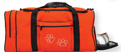
MEDALLIST ATHLETIC GEAR BAG SB208

Approximate dimensions 23 x 10.5 x 10.5" h Imprint area 5.5 x 5"