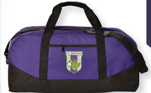
VACATIONER TRAVEL BAG TR6500

Approximate dimensions 23 x 11 x 11" h Imprint area 5 x 5"