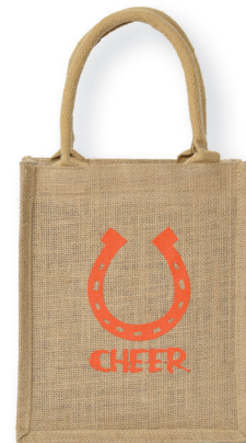
CABO SMALL LAMINATED BURLAP TOTE BAG ITB9411