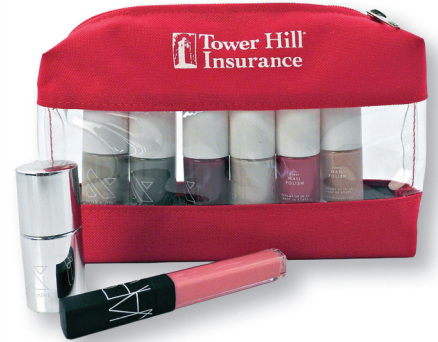
REACTION COSMETIC BAG AC150