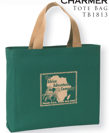
CHARMER TOTE BAG TB1813