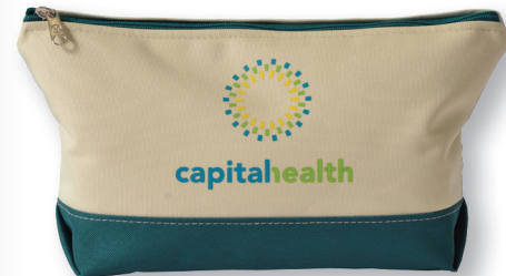
TRAVEL BUDDY TWO-COLOR ACCESSORY BAG AC1347