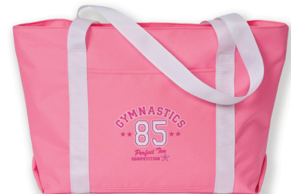
BEACH COMBER TOTE BAG TB1370