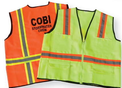
CONSTRUCTION DELUXE SAFETY VEST ISV1015