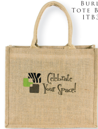
BERMUDA LAMINATED BURLAP TOTE BAG ITB310