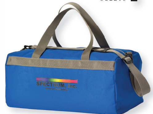
COLISEUM SQUARE END GYM BAG SE2210

Approximate dimensions 22 x 10 x 10" h Imprint area 12 x 5"