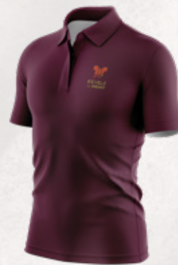
TRADITIONAL DECORATION (SILK SCREEN & EMBROIDERY)

Our line of jackets for management or delivery staff, aprons, towels and accessories such as chair backs and toppers are the perfect complement to create a cohesive look across your entire team.