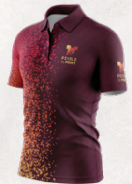
FULL COLOR DYE SUBLIMATION