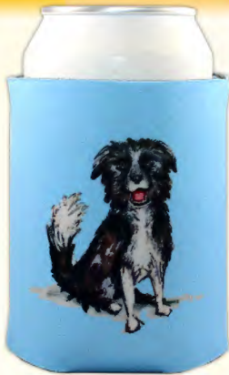
#FSK4CP Minimum 100 $1.03(R)