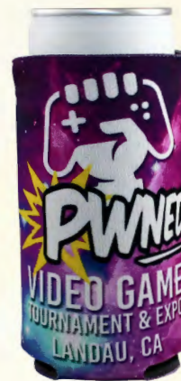
#PFSK4CP Minimum 100 $1.20(R)