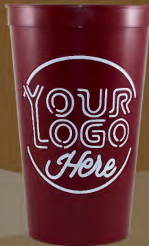
#8722 - 22oz. 100 - 500 Pieces