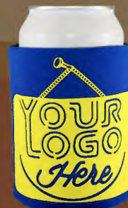
#FSK 100 - 500 Pieces