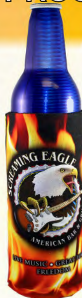
#TBFSK4CP Minimum 100 $1.89(R)