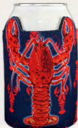
#CF-CRAW4CP Minimum 100 $1.25(R)