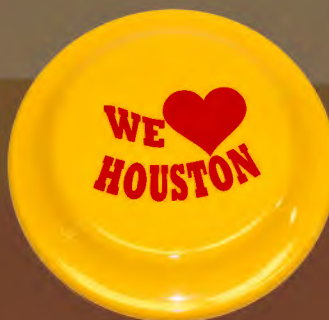
#ZZF 100 - 200 Pieces