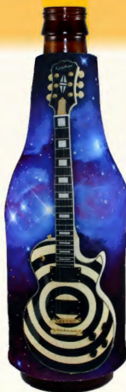
#LBS4CP Minimum 100 $1.60(R)