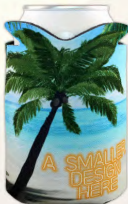
#CF-TROP4CP Minimum 100 $1.25(R)