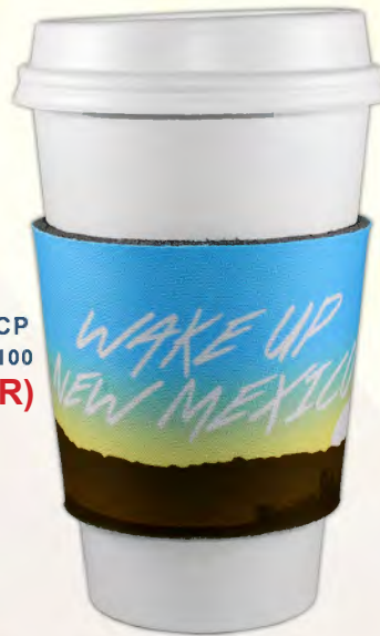
#CW4CP Minimum 100 $.89(R)