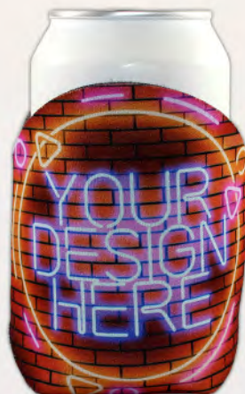
#COA4CP Minimum 100 $1.25(R)