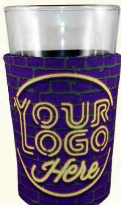
#PGFSK4CP Minimum 100 $1.80(R)