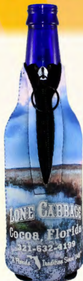
#NPZB4CP Minimum 100 $2.97(R)