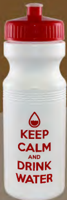
#BIK24W - 24oz. 100 - 200 Pieces