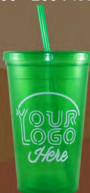
#BT16 120 - 180 Pieces