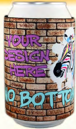
#HSW4CP Minimum 100 $.97(R)