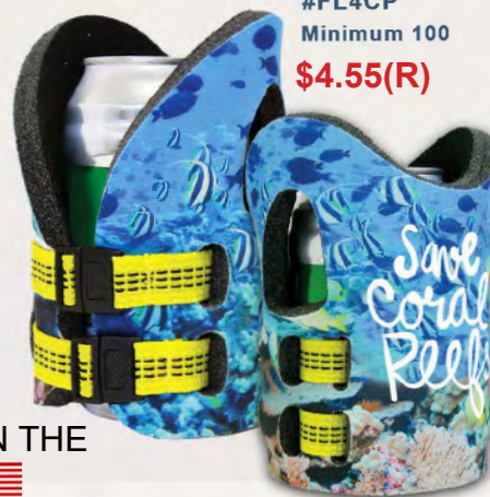
#FL4CP Minimum 100 $4.55(R)