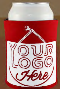
#EFSK 100 - 500 Pieces