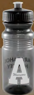
#BIK20TR - 20oz. 100 - 200 Pieces