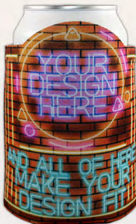
#CF-BALL4CP Minimum 100 $1.25(R)