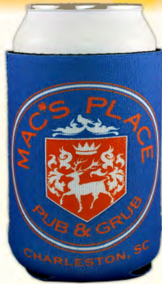
#NPSK4CP Minimum 100 $1.58(R)