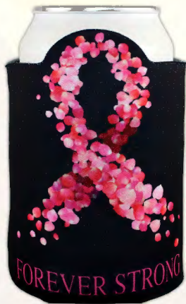
#CF-RIBB4CP Minimum 100 $1.25(R)