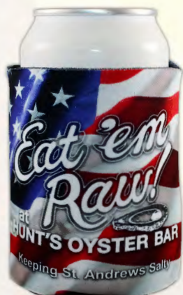
#CF-FLAG4CP Minimum 100 $1.25(R)