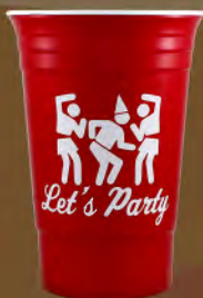
#TPC16 100 - 200 Pieces