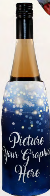
#WBSL4CP Minimum 25 $2.65(R)