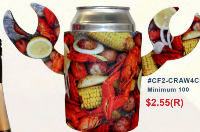
#CF2-CRAW4CP Minimum 100 $2.55(R)