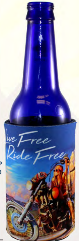
#BFSK4CP Minimum 100 $1.55(R)