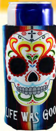
#SLFSK4CP Minimum 100 $1.25(R)