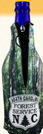
#SZB4CP Minimum 100 $2.49(R)