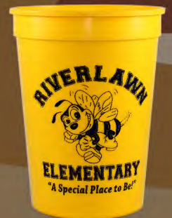
#8112 - 12oz. 100 - 500 Pieces