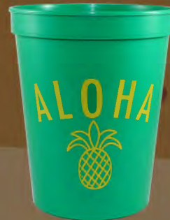
#8716 - 16oz. 100 - 500 Pieces