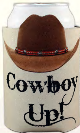
#CF-HAT4CP Minimum 100 $1.25(R)