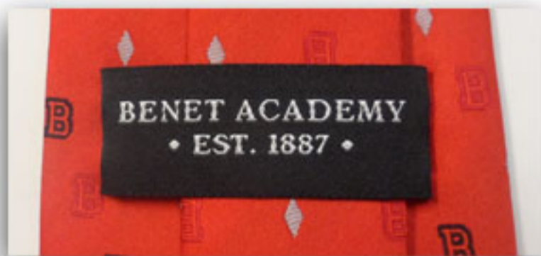
Custom Woven Label