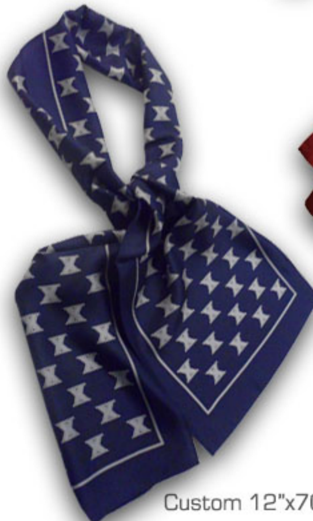
Custom 12"x70" Scarf