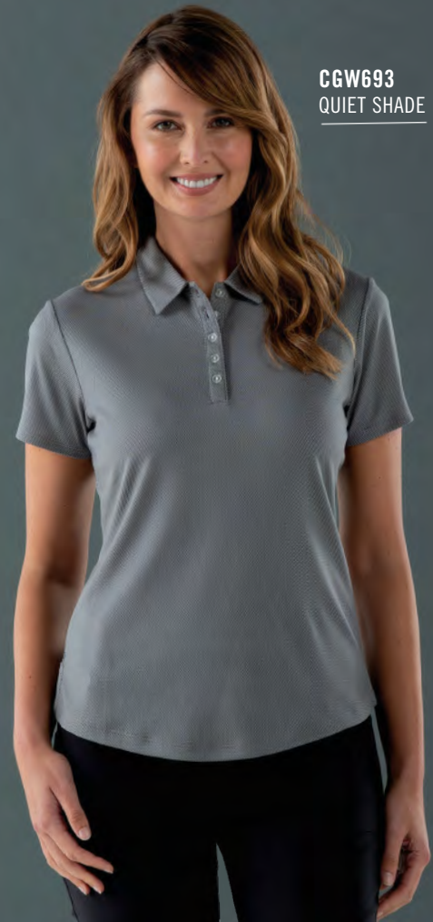
CGW693 QUIET SHADE