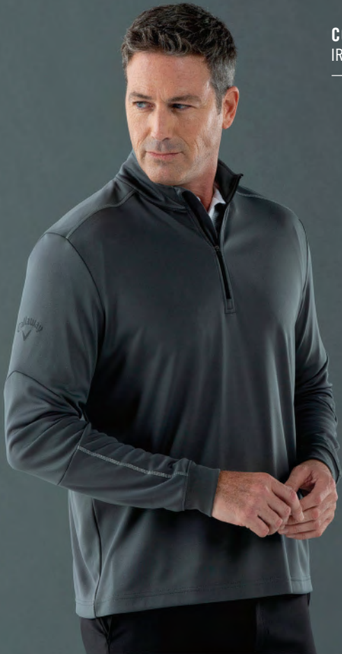
CGM540 IRON GATE