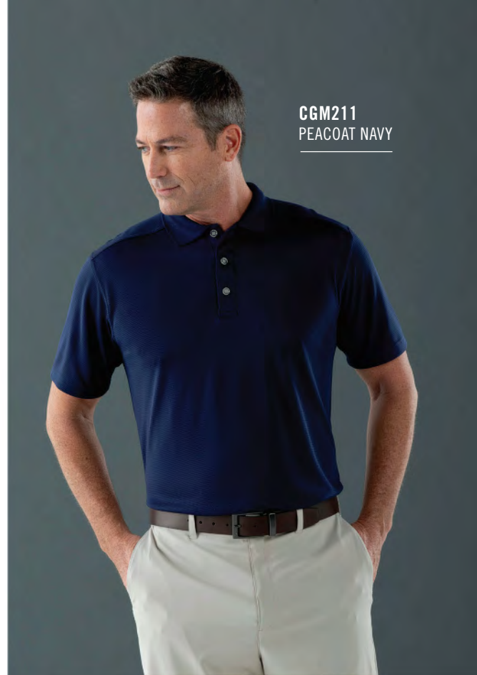
CGM211 PEACOAT NAVY