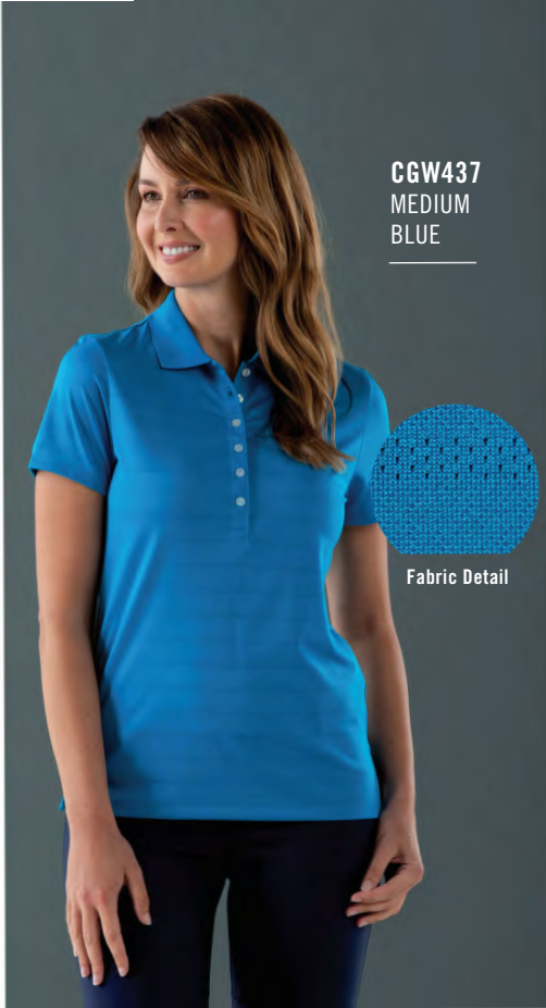
CGW437 MEDIUM BLUE