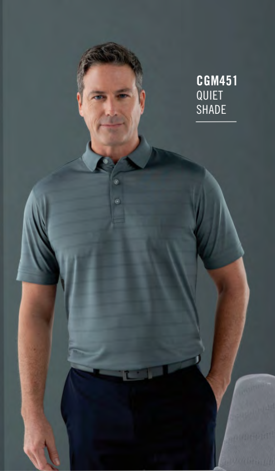
CGM451 QUIET SHADE