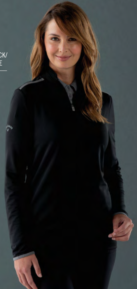
CGW509 CAVIAR BLACK/ QUIET SHADE