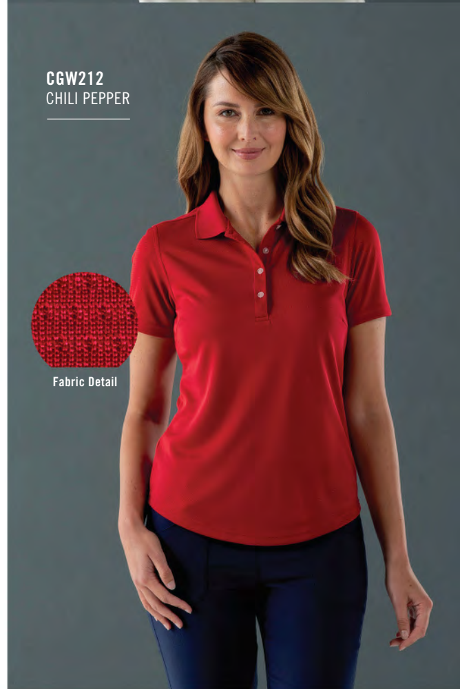
CGW212 CHILI PEPPER