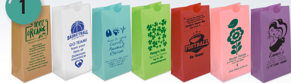
#POP NATURAL #POP WHITE #POP BLUE #POP GREEN #POP RED #POP PINK #POP PURPLE