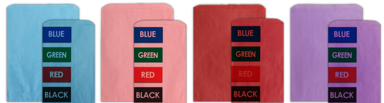
#PPRBLUE - Medium Bag #SPPRBLUE - Small Bag