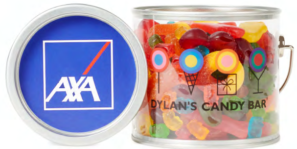
Yummy Gummy Mix

Price includes: 4 color process label on lid. Body of paint can is branded with the Dylan's Candy Bar logo. Set Up: $60 (V). Item Size: 4"Dia. x 3.5"H. Imprint Size: 3" Dia. PMS Match: As close as possible at no charge. Misc: Create your own artwork or add your logo to our seasonal snowflake design. Please specify choice when ordering.