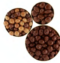
Salty & Sweet