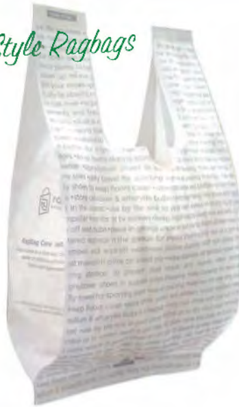
Back side stock imprint (optional)