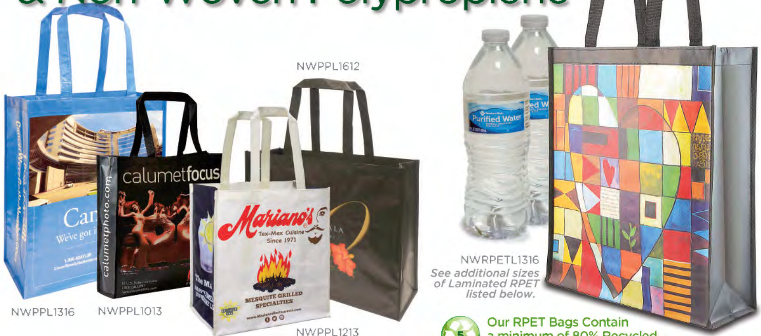
NWRPETL1316 See additional sizes of Laminated RPET listed below.