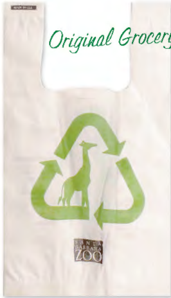
Original Grocery Style Ragbags