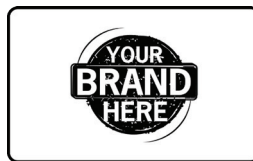
Custom Reward Link