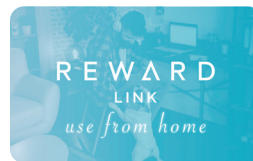
Reward Link Home