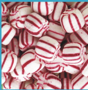
Soft Peppermints 1,000 Count