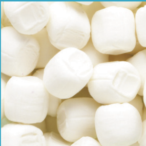
Buttermints 1,000 Count