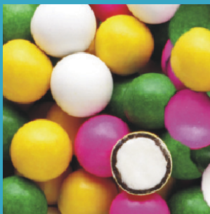
Assorted Chocolate Pastels 1,000 Count