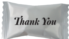
Thank You Item Code: TYOU