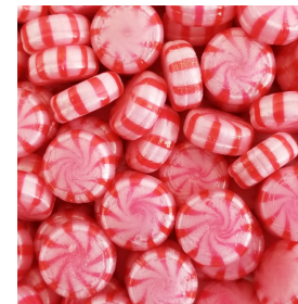
Cinnamon Starlites 1,000 Count