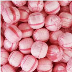
Hard Cinnamon Balls 1,000 Count