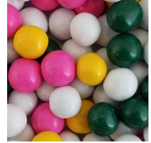
Assorted Chocolate Pastels 1,000 Count