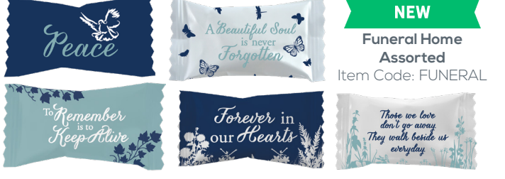
NEW Funeral Home Assorted Item Code: FUNERAL