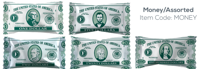
Money/Assorted Item Code: MONEY

We ♥ Our Customers - Item Code: WLOC We ♥ Our Patrons - Item Code: WLOP We ♥ Our Students - Item Code: WLOS We ♥ Our Members - Item Code: WLOM We ♥ Our Residents - Item Code: WLOR We ♥ Our Clients - Item Code: WLOCL