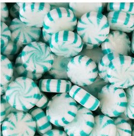
Green Peppermint Starlites 1,000 Count