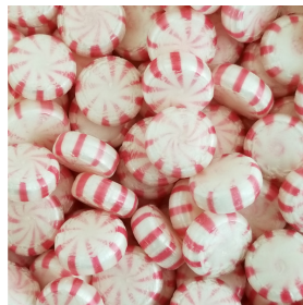
Red Peppermint Starlites 1,000 Count