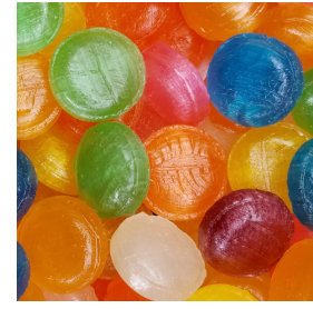
Assorted Fruit Buttons 1,000 Count Tangerine, Strawberry, Pineapple, Peppermint, Green Apple, Wild Cherry, Sour Cherry, Lemon, Butterscotch