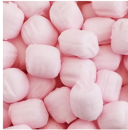
Pink Buttermints 1,000 Count