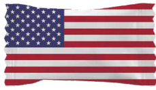
Flag Item Code: FLAG