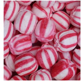
Soft Peppermints 1,000 Count