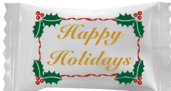
Happy Holidays Item Code: HH