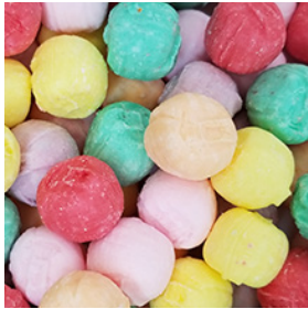
Soft Sours 1,000 Count