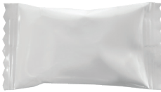
White Wrapper No Imprint Item Code: NOI