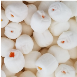
Jelly-Filled Mints Lemon & Orange 1,000 Count - Custom Only