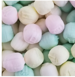
Pastel Buttermints 1,000 Count