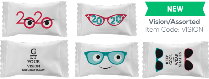
NEW Vision/Assorted Item Code: VISION