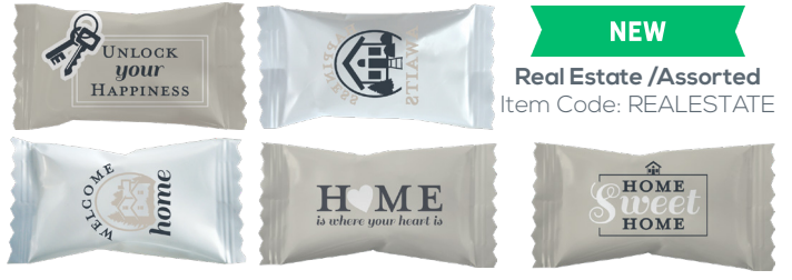
NEW Real Estate /Assorted Item Code: REALESTATE