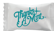
Thanks A Mint Classic Code: TAM