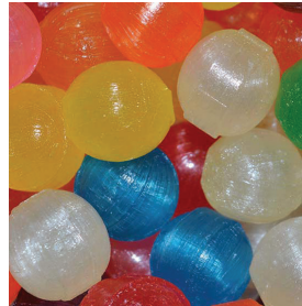
Assorted Fruit Balls 1,000 Count