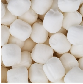
Buttermints 1,000 Count