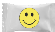
Smiley Face Item Code: SMILE