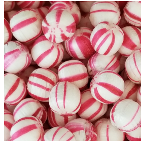
Hard Peppermint Balls 1,000 Count