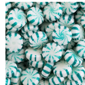
Spearmint Starlites 1,000 Count