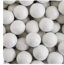
White Chocolate Pastels 1,000 Count - Custom Only