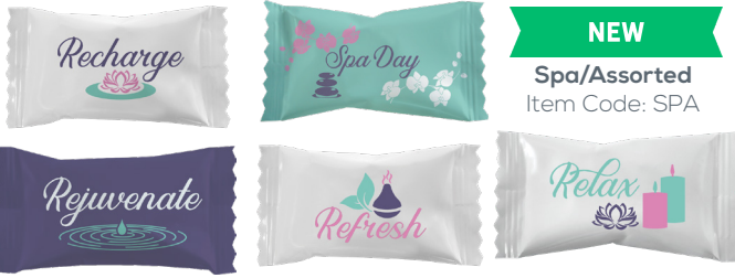
NEW Spa/Assorted Item Code: SPA