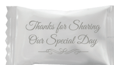
Thanks for Sharing Our Special Day Item Code: TSSDS (Gold or Silver Ink)