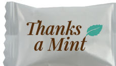
Thanks A Mint Item Code: THAM