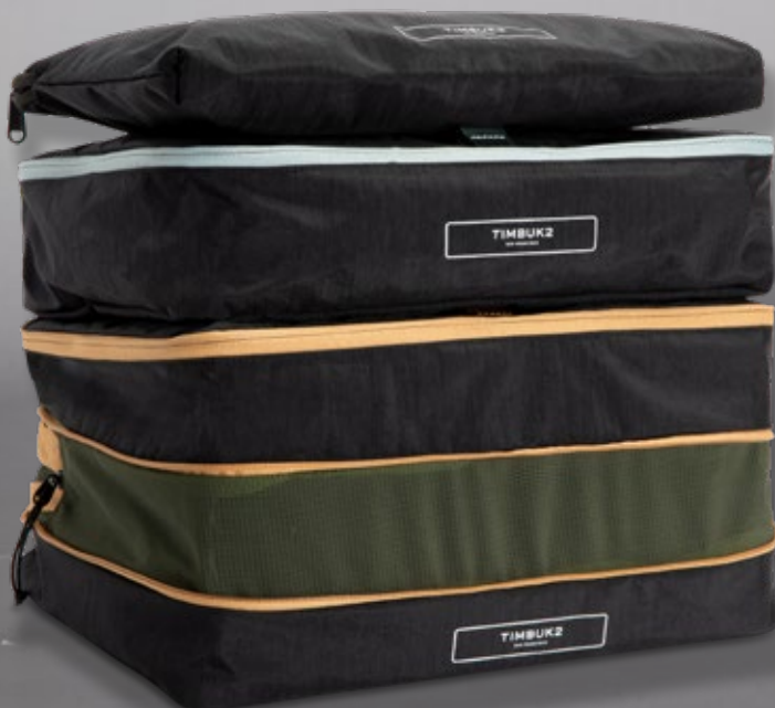
Stack Packing Cubes 6867-3-1030 MSRP $49