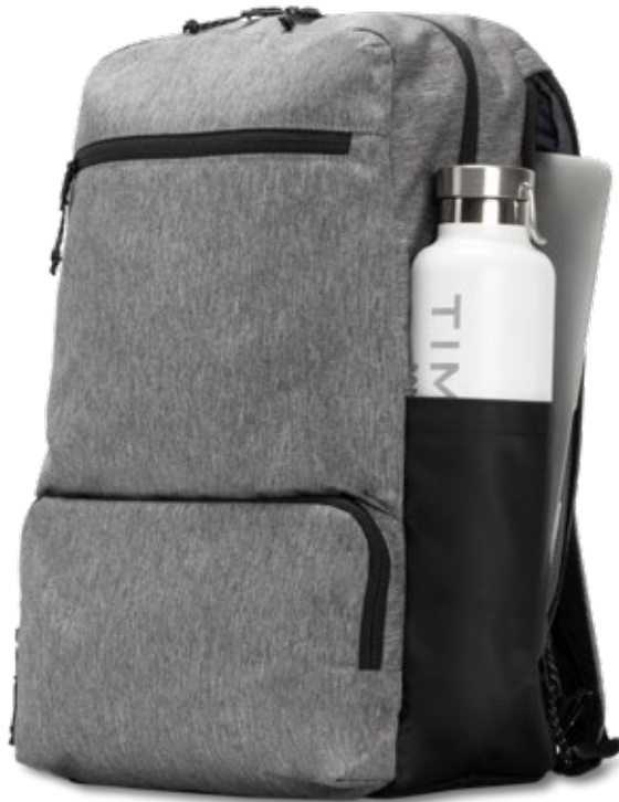
Incognito Core Pack 1117-3-1282 MSRP $50