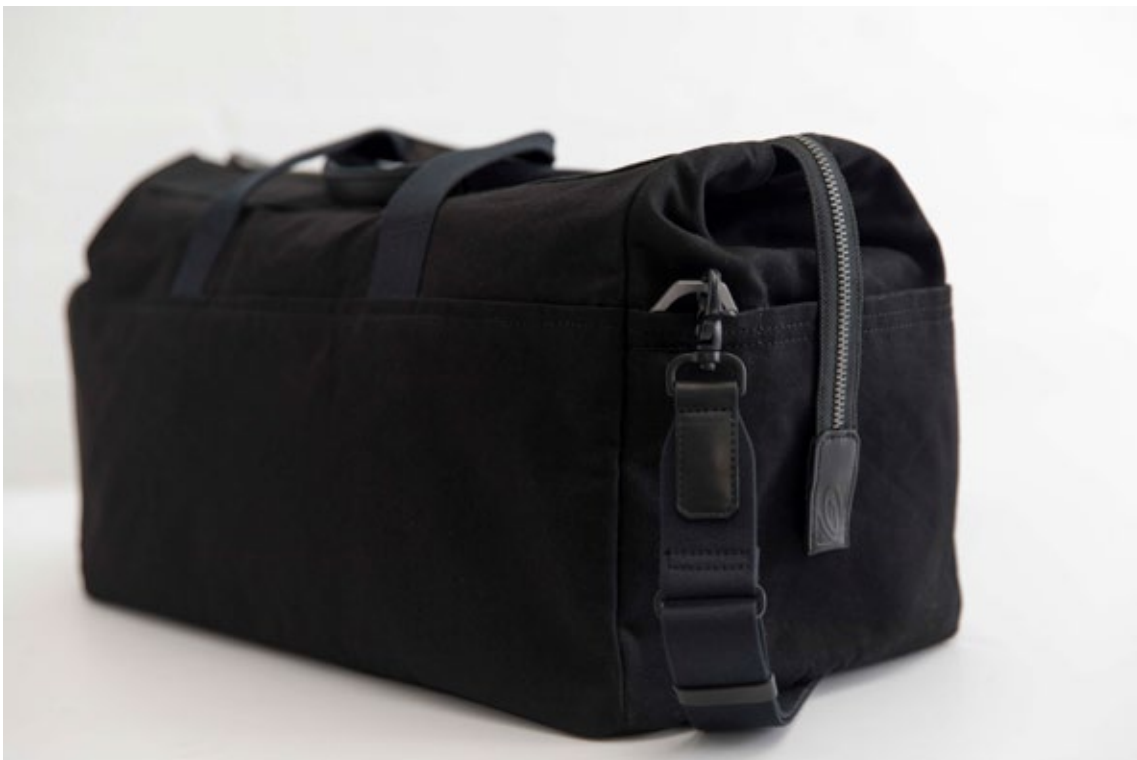
Mason Duffel 5678-3-6114 MSRP $249