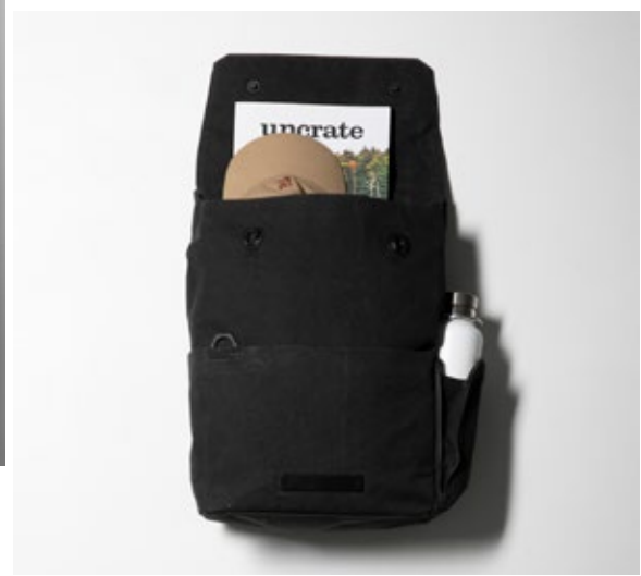
Foundry Pack 1920-3-6114 MSRP $229