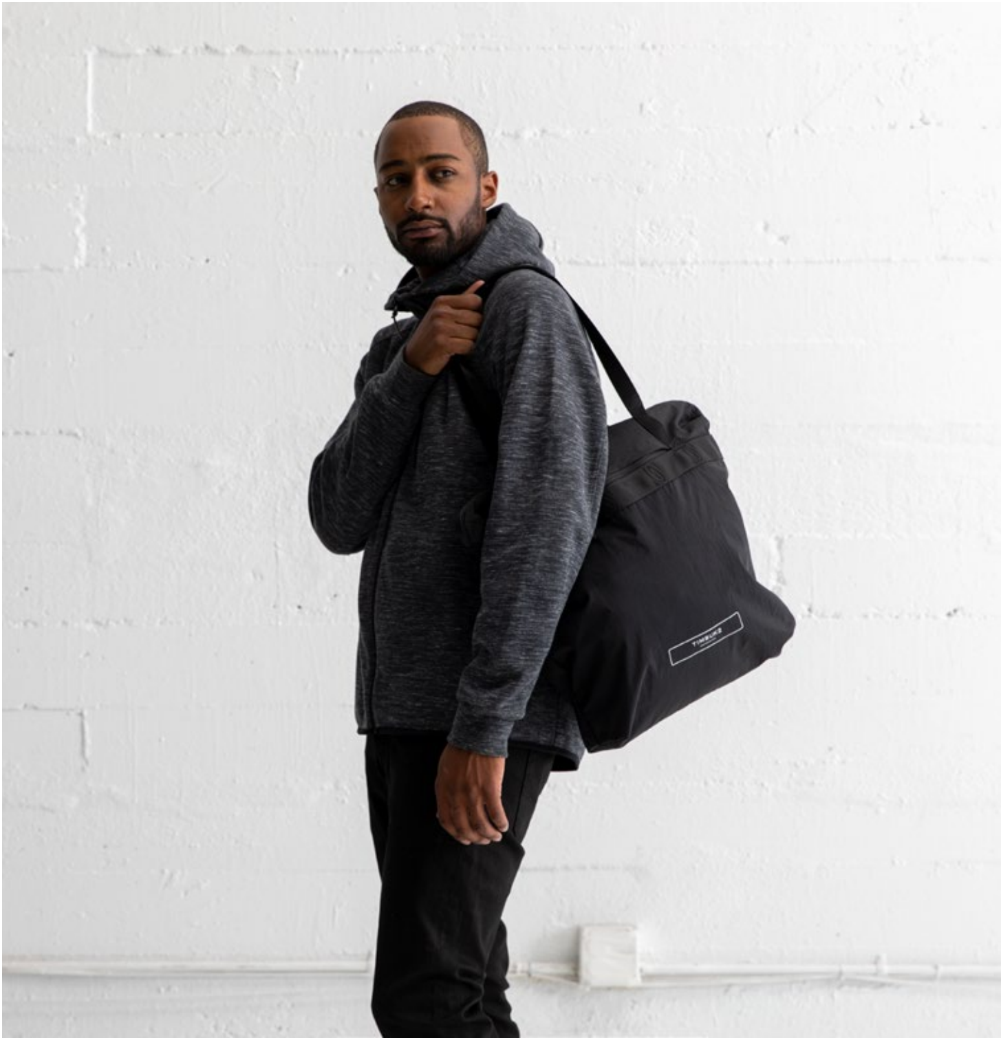
Packable Travel Tote 8884-3-6114 MSRP $79