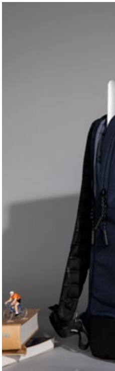
Authority DLX 1825-3-1062 MSRP $139