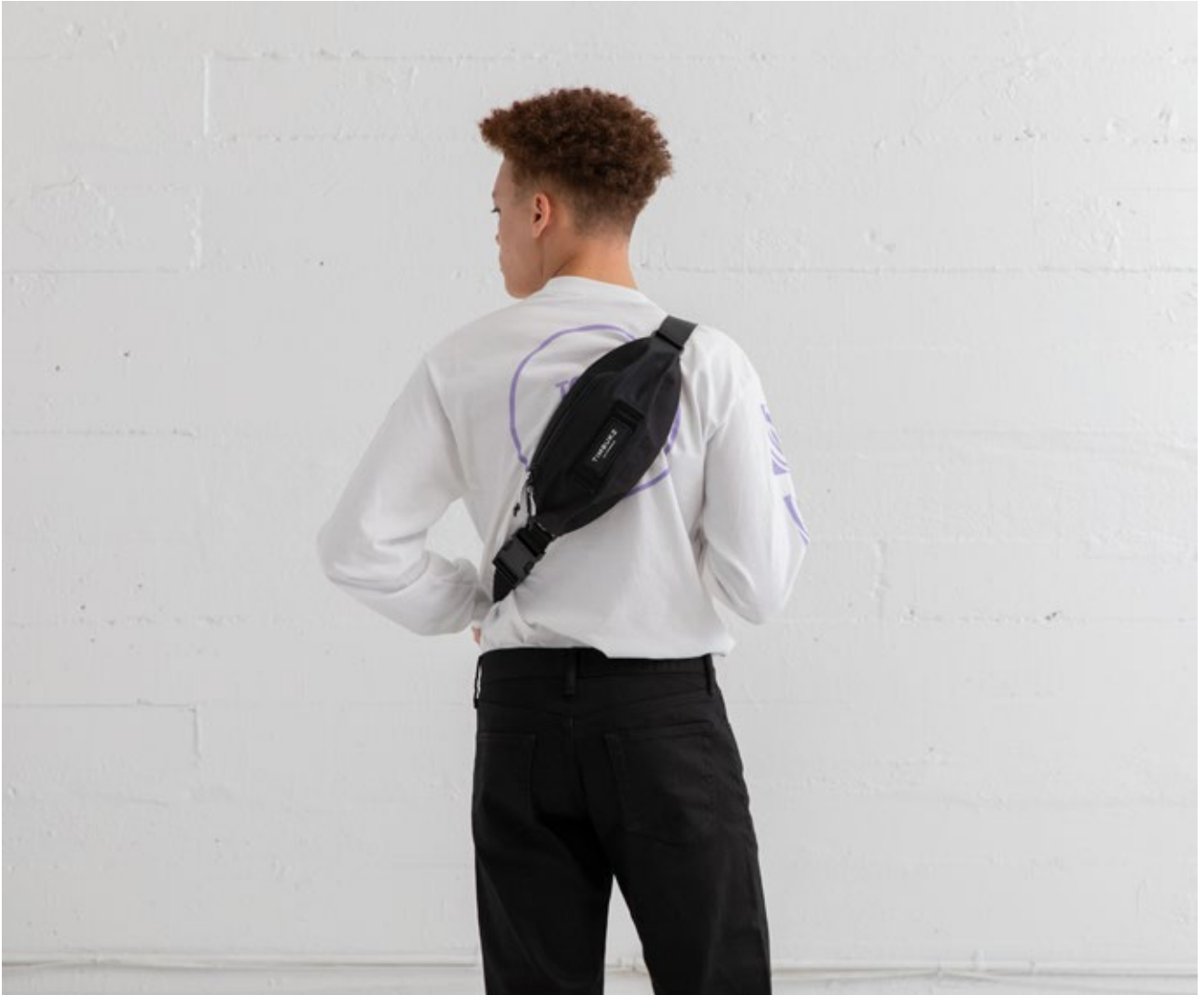
Slacker Chest Pack 3951-3-6114 MSRP $49