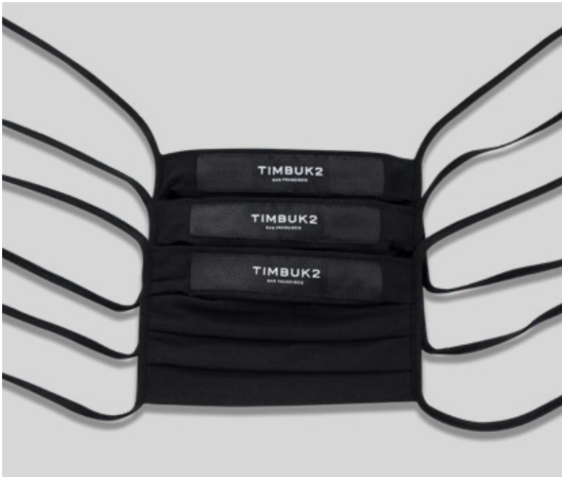
Reusable Face Mask 7771-4-2000 MSRP $30