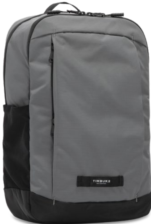
Parkside 2.0 3840-3-2003 MSRP $79