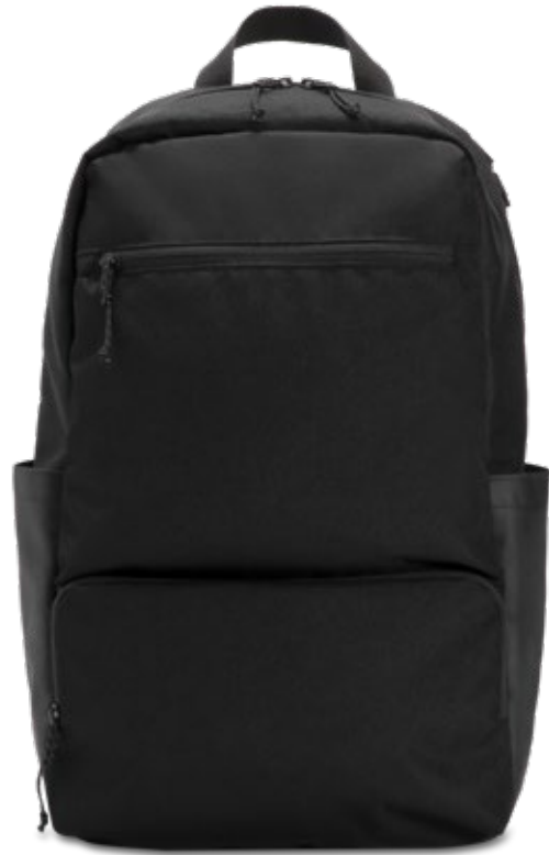
Incognito Core Pack 1177-3-2679 MSRP $50