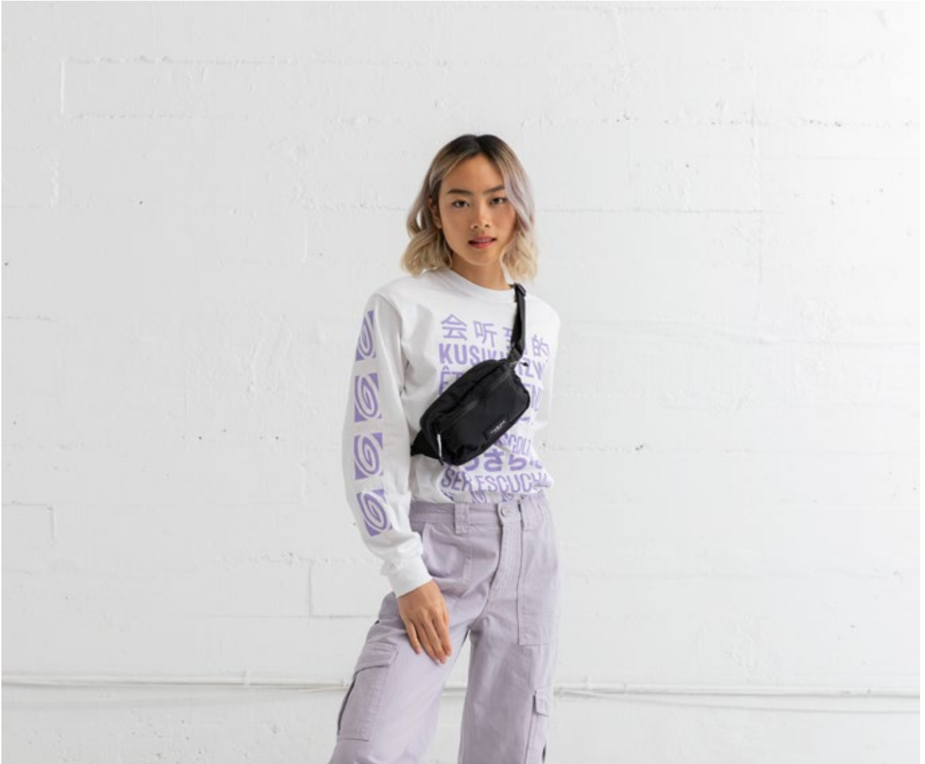
Rascal Belt Bag 3950-3-6114 MSRP $49