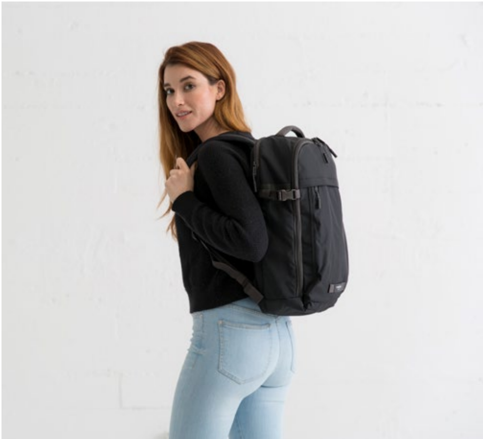
Division Pack 1849-3-6114 MSRP $109