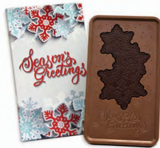
Item #316003 Season's Greetings/Snowflake 1 lb. Combo Bar Case of 5: $121.55 ($24.31 ea)/R