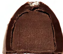
SEA SALT CARAMEL