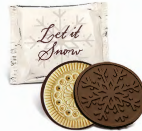
Item #320410 Snowflake Dark Chocolate Cookies Case of 50: $105.50 ($2.11 ea)/R