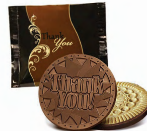
Item #320490 Thank You Milk Chocolate Cookies Case of 50: $105.50 ($2.11 ea)/R