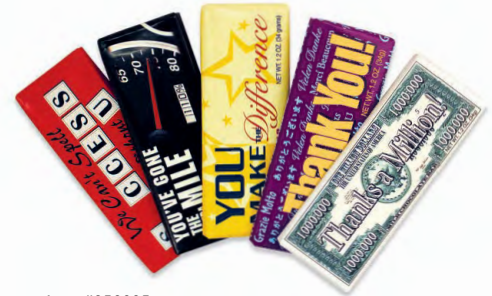
Item #350005 Employee Recognition Assortment Case of 50: $108.15 ($2.16 ea)/R

STOCK COLLECTION ITEMS ARE READY TO SHIP IN 3 WORKING DAYS OR LESS! HOLIDAY • THANK YOU • RECOGNITION • TAX SEASON • SAFETY & HEALTHCARE • GIFT BOXES & BASKETS