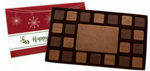
Item #302135 45-Pc Holiday Chocolate Assortment Case of 5: $165.00 ($33.00 ea)/R