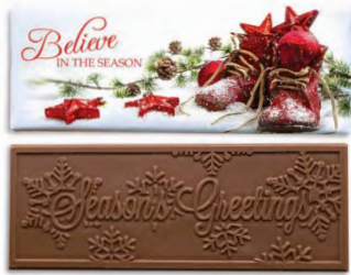
Item #310053 Santa Boots Milk Chocolate Bar Case of 50: $100.65 ($2.01 ea)/R

Visit our website for dozens of Ready to Ship Options!