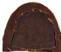
CHOCOLATE on CHOCOLATE