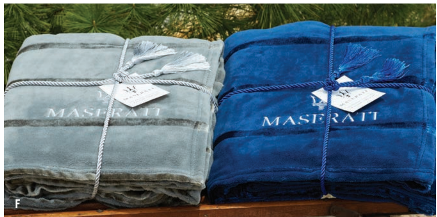
F. BRAIDED TASSEL AND GIFT CARD

Blankets with this option have the ribbon and card attached and are shipped in a protective vinyl case. Ribbon colors: beige, red, grey, royal blue, or hunter green.