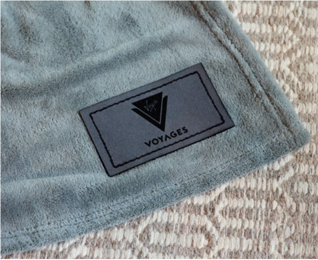
Light grey with laser patch.