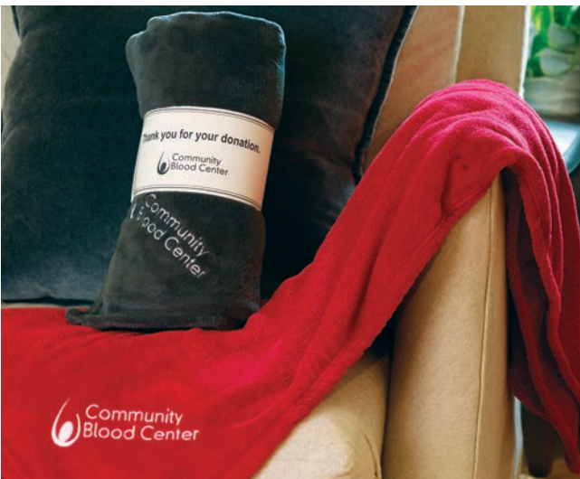
Shown above with embroidery and optional Message Wrap (page 50).