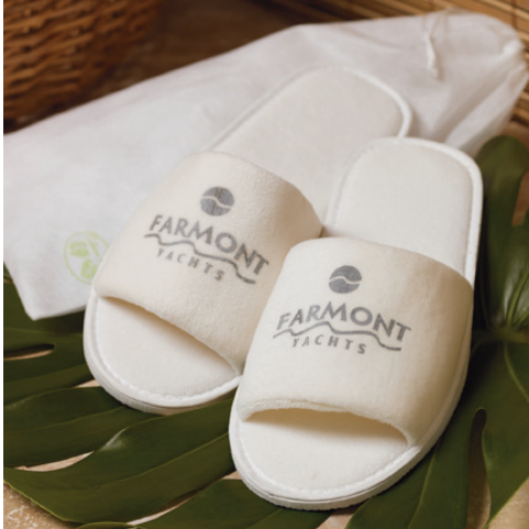
A. Open Toe Velour Slippers in Travel Bag (SV02)

The perfect complement to our fine robes, these slippers are available in four styles, with custom imprint. Each slipper set is shipped inside a 7" x 14" blank drawstring travel bag for both enhanced presentation and safekeeping.