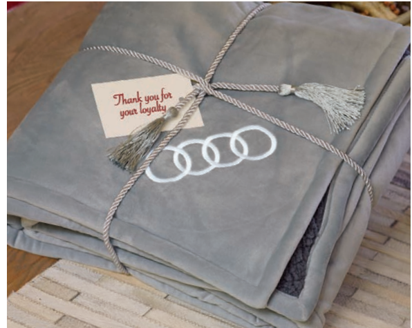
Shown embroidered with Braided Tassel and gift card (pg. 51).