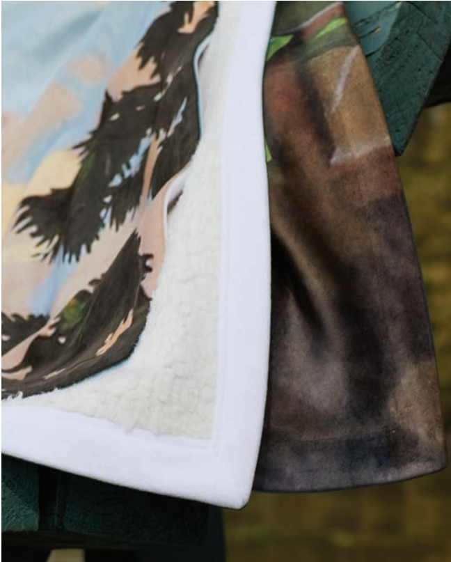
Thick Sherpa back provides extra warmth.