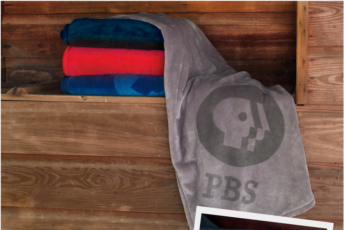
Tone on Tone logo in corner on black, red, navy or silver grey.