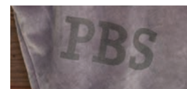
TONE ON TONE