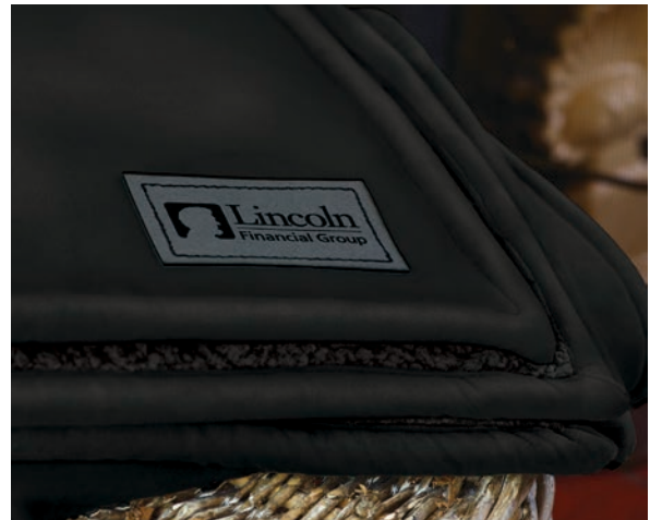
Shown above with laser patch.