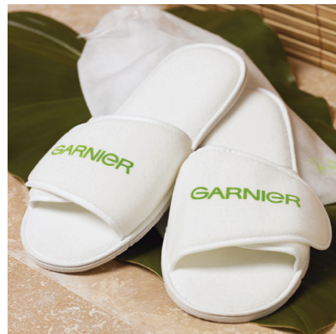
D. Terry Velour Adjustable Slippers in Travel Bag (SVLC05)