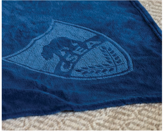
Navy with corner Tone on Tone logo.