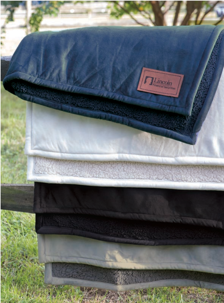
Available with either navy, ivory, black or light silver outer shell.