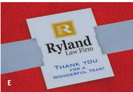
E. CUSTOM GIFT CARD & CLOTH RIBBON

Select this 2" wide blank ribbon, tied in an attractive tuxedo bow, to wrap around your blanket. Blankets will be folded, tied with ribbon, and placed in a protective vinyl case. Available in beige, red, grey, royal blue, or hunter green. See Option E for custom gift card.