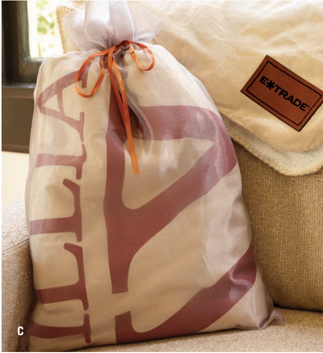
C. ORGANZA BAG

Present blankets inside this sheer bag with its satin, copper colored drawstring tie. Note that bags may not be decorated. This option does not include vinyl carry case.