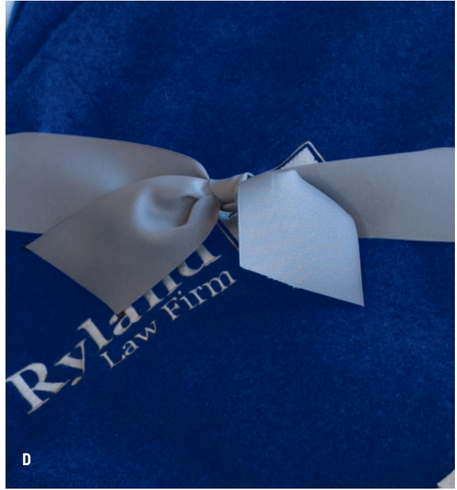
D. CLOTH RIBBON

Present blankets inside this sheer bag with its satin, copper colored drawstring tie. Note that bags may not be decorated. This option does not include vinyl carry case.