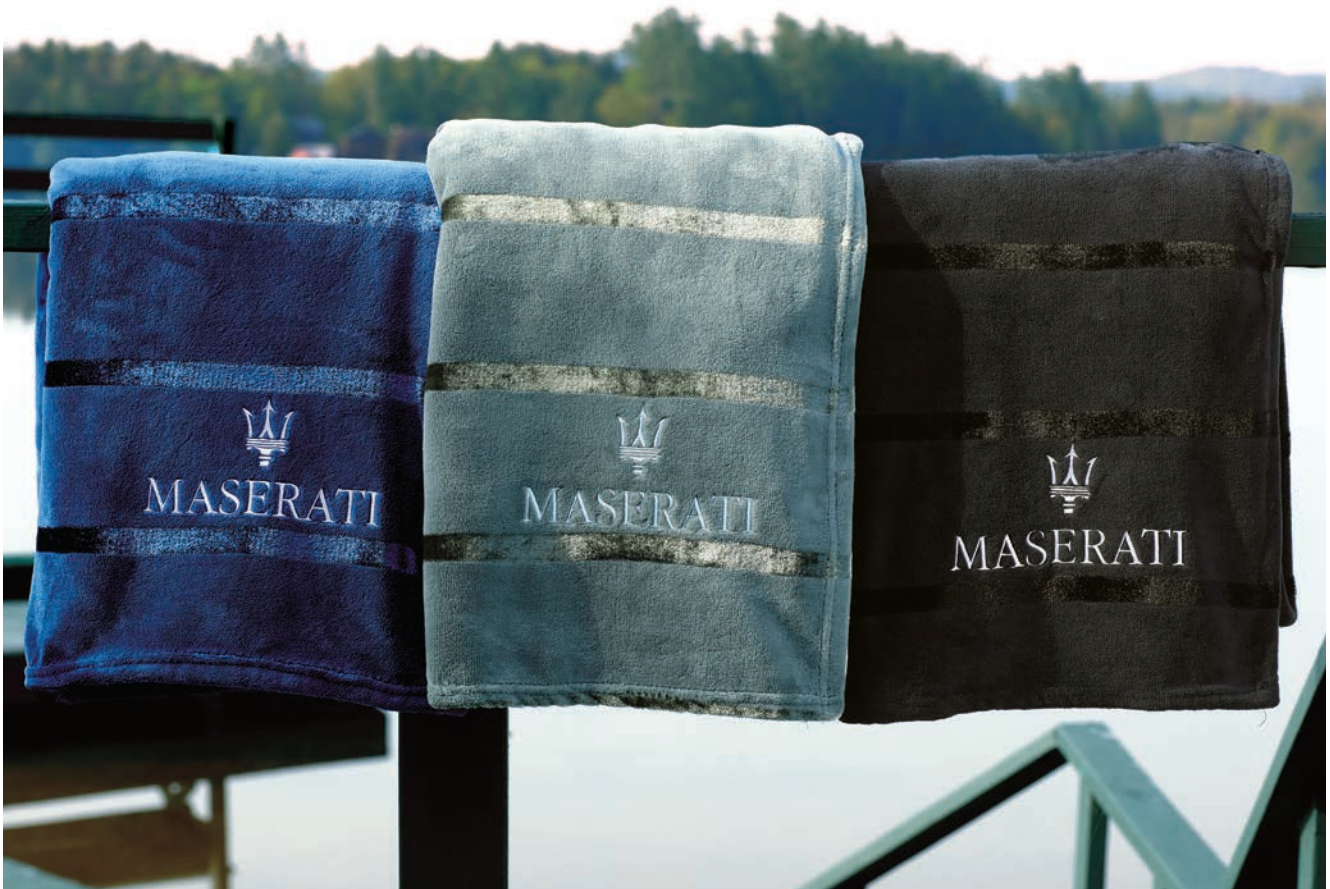
At an oversized 60" x 70", the Brighton Striped Blanket is available in navy, grey or black.