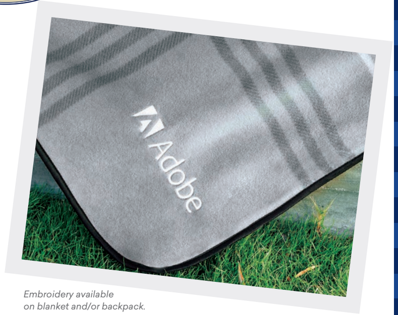
Embroidery available on blanket and/or backpack.