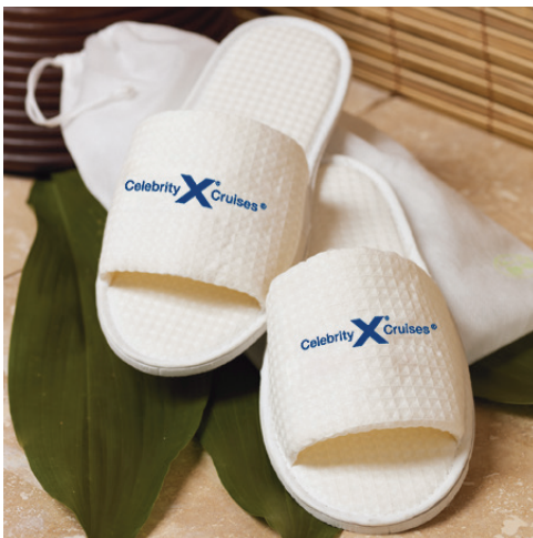
C. Open Toe Waffle Weave Slippers in Travel Bag (SW01)