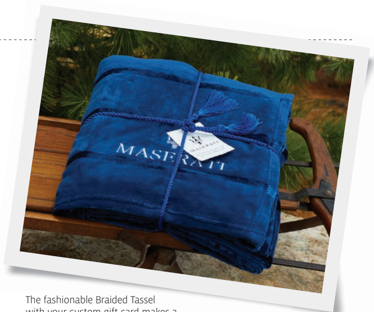
The fashionable Braided Tassel with your custom gift card makes a stylish presentation (page 51).