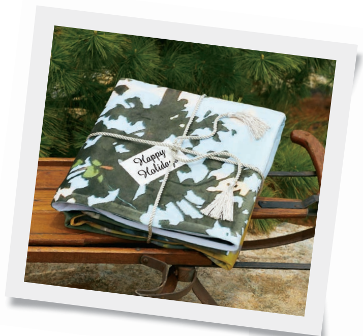
The fashionable Braided Tassel, with your custom gift card, makes for a stylish presentation (page 51).