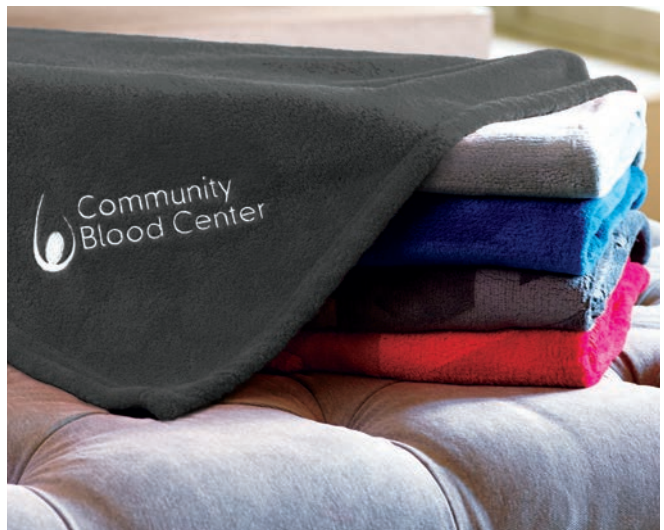
Available in granite grey, light grey, navy, black, and red.