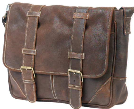
Sorrento Computer Messenger