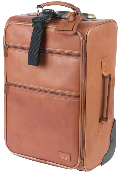
Classic 22 Pullman