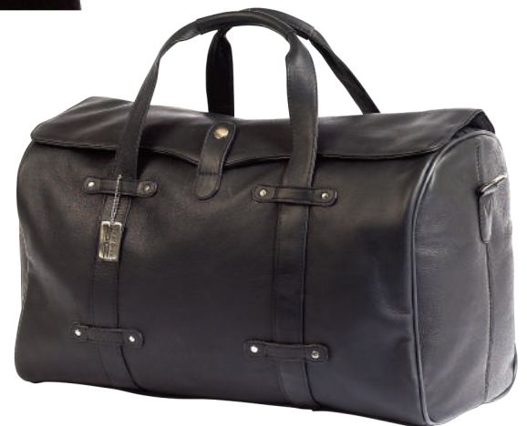
Lindy Duffel Style # 308 Dimensions 18.25 x 11.5 x 9 $315.00 (a)