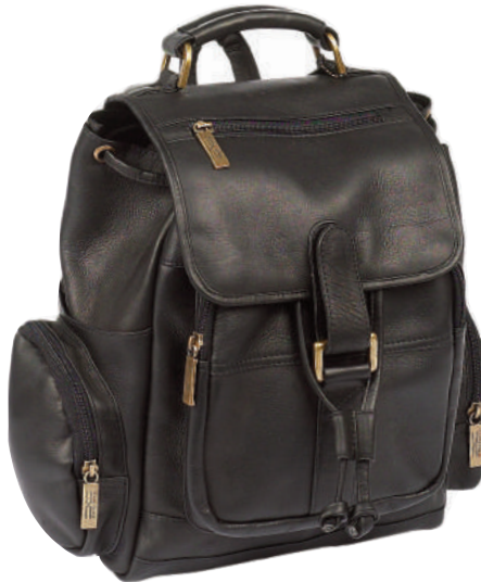
Uptown Back Pack