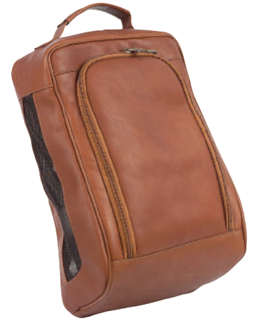
Luxury Golf Shoe Bag