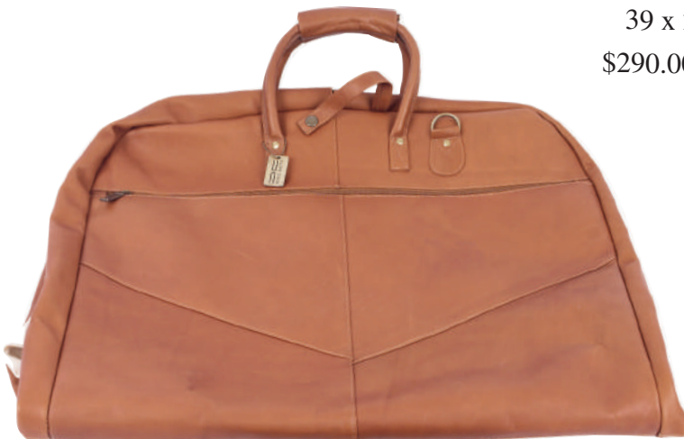
Bi-Fold Garment Sleeve