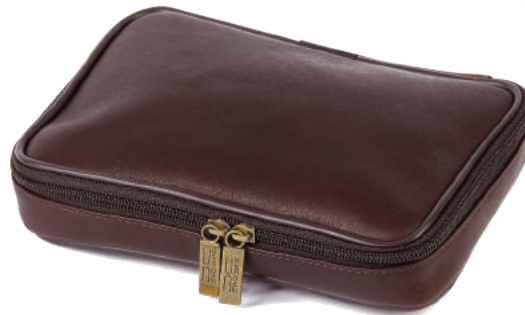
Unisex Travel Kit Style #700 Dimensions 9 x 6 x 2 $44.00 (a)