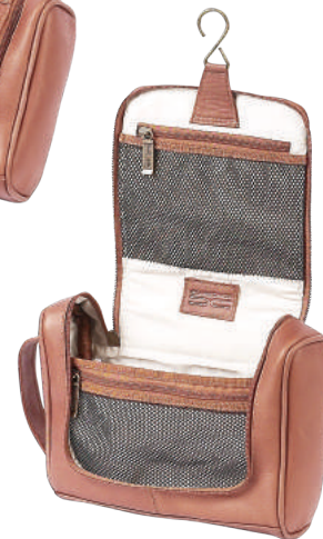
Hanging Travel Kit Style # 774 Dimensions 10 x 8 x 3.5 $92.00 (a)