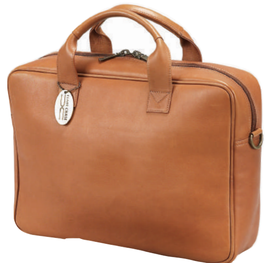
Small Business Brief