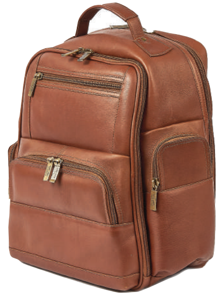
Executive Back Pack