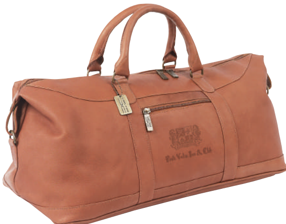
All American Duffel