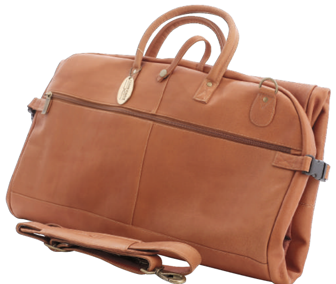
Tri-Fold Garment Sleeve