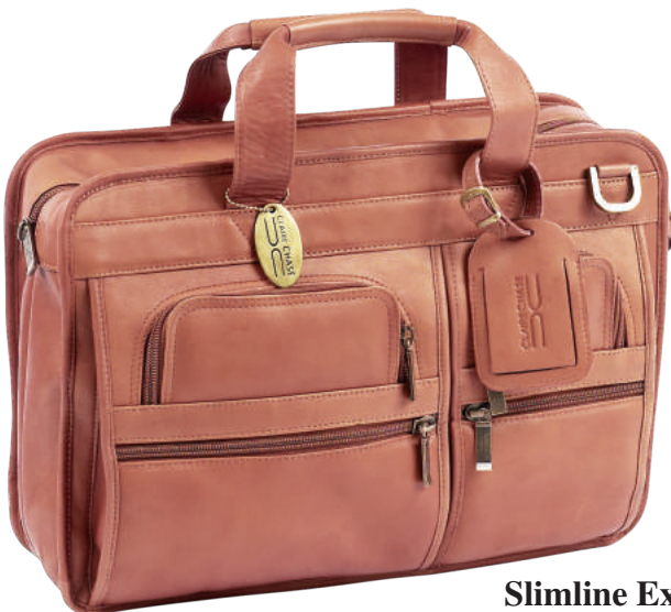
Slimline Executive Brief