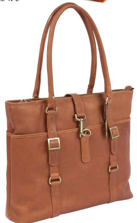
Ladies Computer Handbag Style # 798 Dimensions 16.5 x 13.5 x 4.5 $269.00 (a)