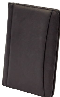
Half Moon Folio