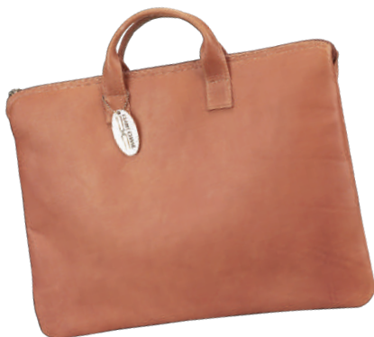
Zippered Folio w/Handle