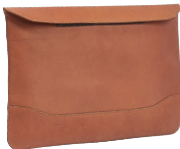
Legal Folio w/Velcro Closure