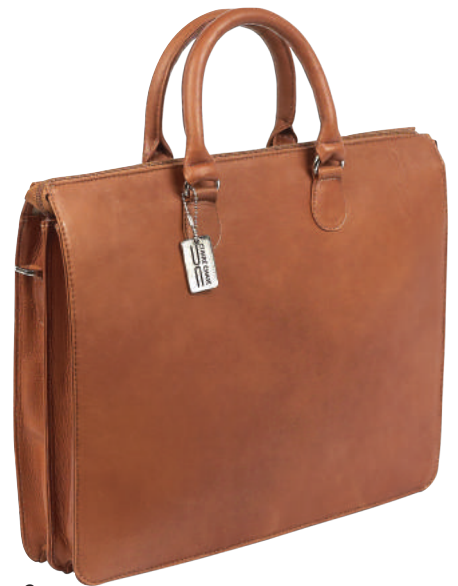
Sarita Briefcase Style # 147 Dimensions 15 x 12 x 3 $269.00 (a)