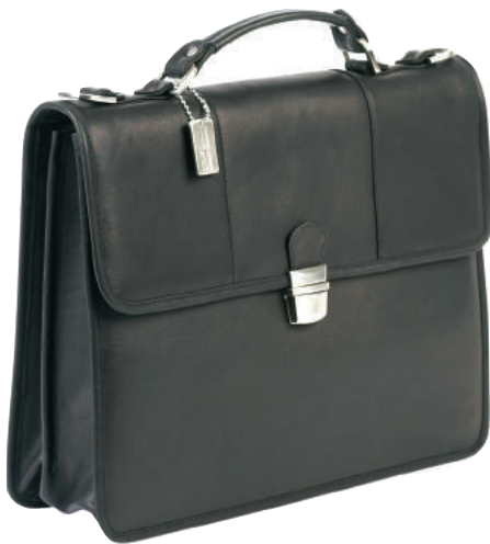
Tuscan Briefcase (Unisex) Style # 148 Dimensions 15 x 12 x 5 $269.00 (a)