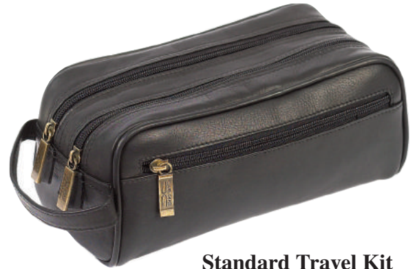
Standard Travel Kit Style # 772 Dimensions 10 x 5 x 5 $86.00 (a)