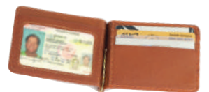
Ultimate Money Clip