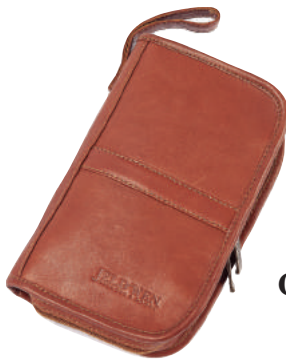
Golf Accessory Kit