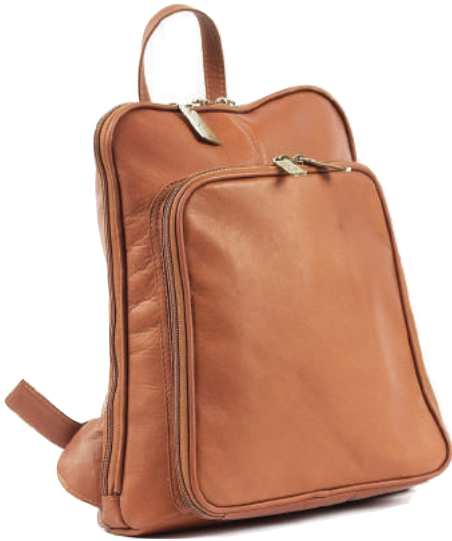
Tablet Back Pack