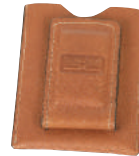
Magnetic Money Clip