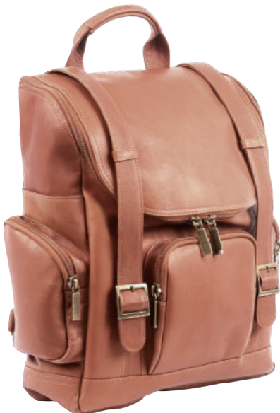
Portofino Computer Back Pack