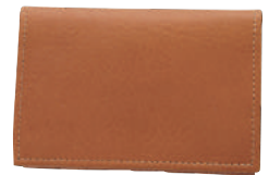
Business Card Holder Style # PT-437 Dimensions 3.5 x 2.75 $32.00 (a)