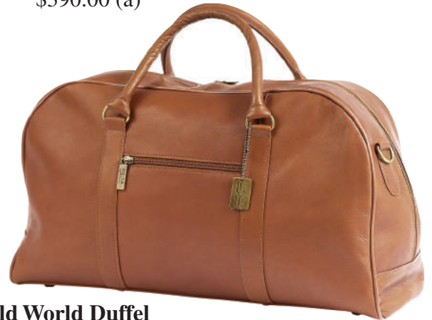
Old World Duffel