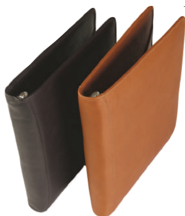
Classic Three-Ring Binder