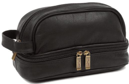
Mediterranean Travel Kit Style # 775 Dimensions 10 x 5.5 x 5 $92.00 (a)