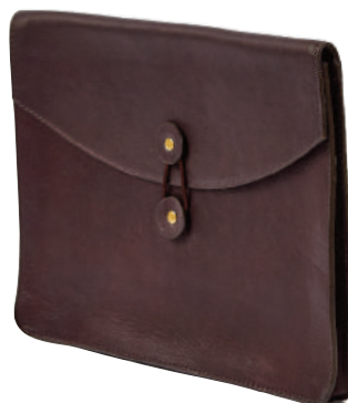
Luxury Ipad Holder