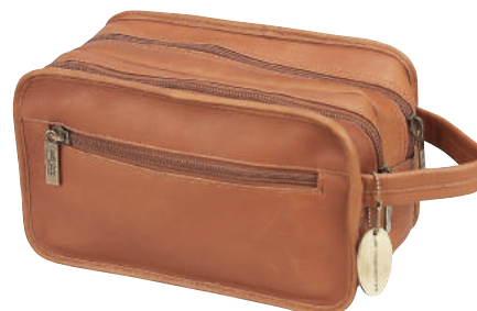
Luxury Travel Kit