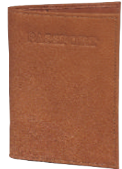
Passport Holder Style # PP-600 Dimensions 5 x 4 $32.00 (a)