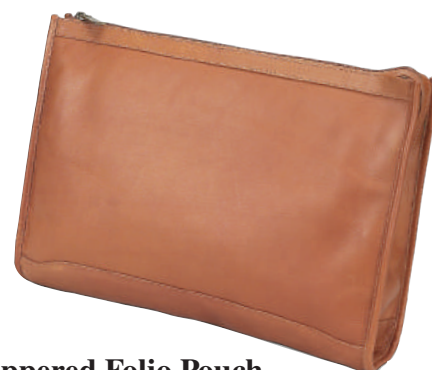
Zippered Folio Pouch