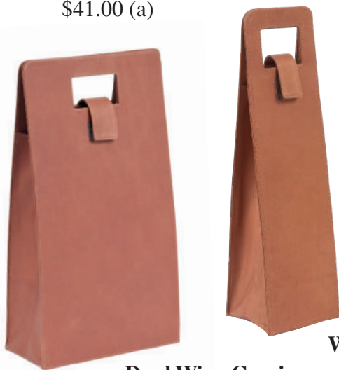
Dual Wine Carrier