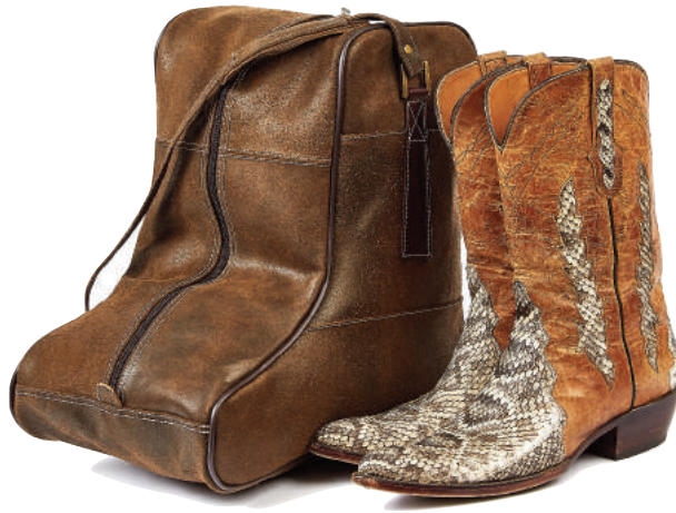
Ranchero Boot Bag