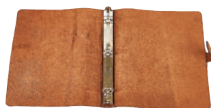
Soft Sided Rustic 3 Ring Binder