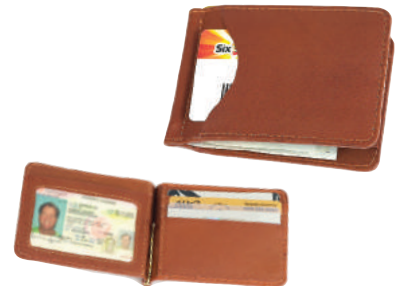
Ultimate Money Clip Style # PT-462 Dimensions 4.5 x 3 $50.00 (a)