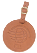
Round ID Bag Tag