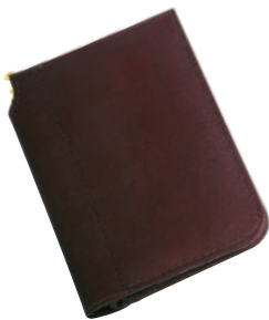
Jotter Pad Style # PN-110 Dimensions 5.25 x 4 $33.00 (a)