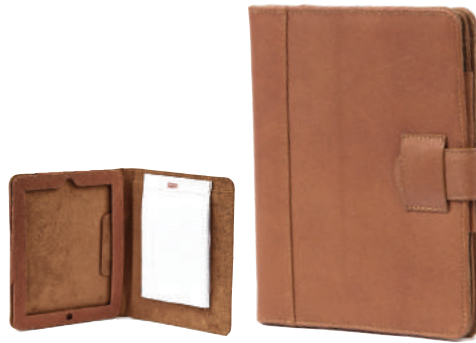
Ipad Notebook with Closure