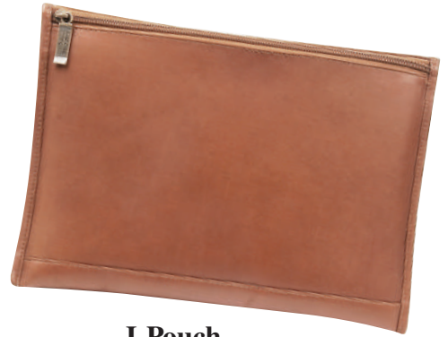
I-Pouch Style # IP-300 Dimensions 12.5 x 8.75 x .5 $59.00 (a)