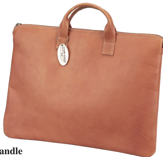
Zippered Folio w/ Handle