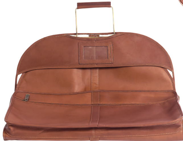
Ultra Garment Carrier