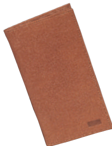
Checkbook Wallet Style # CH-200 Dimensions 5.25 x 3 x .5 $49.00 (a)