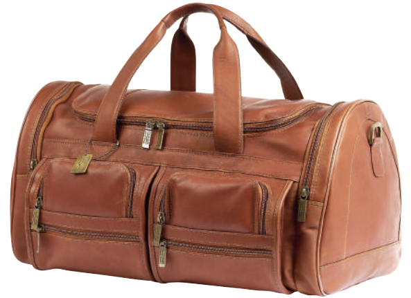
West Coast Duffel Style # 376 Dimensions 19.75 x 9.5 x 9 $356.00 (a)