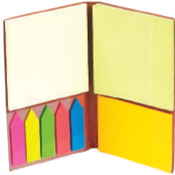
Sticky Pad Holder Style # PT-480 Dimensions 5.25 x 3 x .5 $32.00 (a)