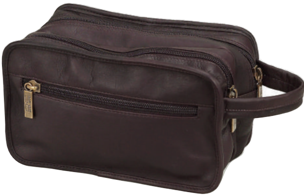
Luxury Travel Kit Style # 771 Dimensions 10 x 6 x 6 $92.00 (a)