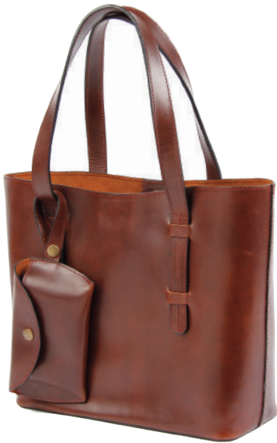
Glasses Tote Style # 755 Dimensions 12 x 11.5 x 5 $210.00 (a)