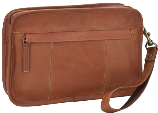
Travel Pouch Style # 777 Dimensions 9.5 x 6.5 x 2 $50.00 (a)