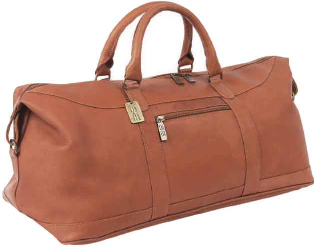
All - American Duffel Style # 311 Dimensions 20 x 10 x 9 $234.00 (a)