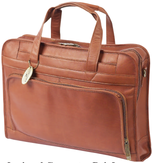
Professional Computer Briefcase