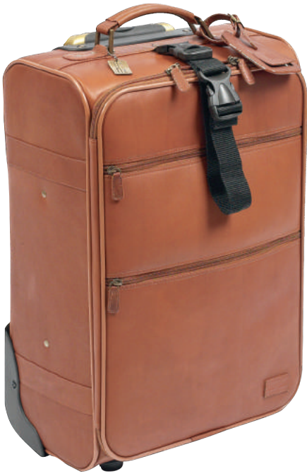
Classic 21 Pullman