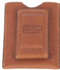
Magnetic Money Clip Style # PT490 Dimensions 3.5 x 2.75 $48.00 (a)