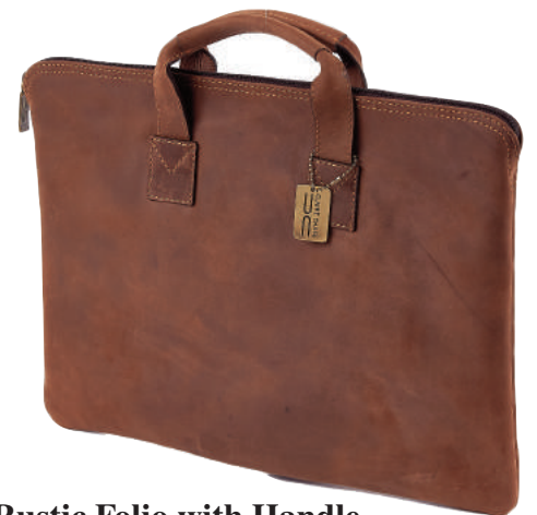
Rustic Folio with Handle