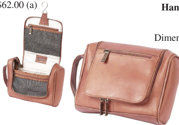
Hanging Travel Kit