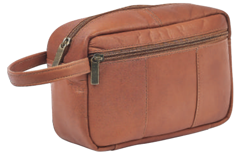
Travel Kit Style # 780 Dimensions 8 x 5 x 3 $56.00 (a)