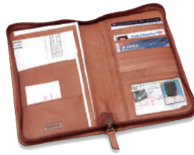
Travel Wallet Style # OV-6040 Dimensions 8 x 4.5 x 1 $112.00 (a)