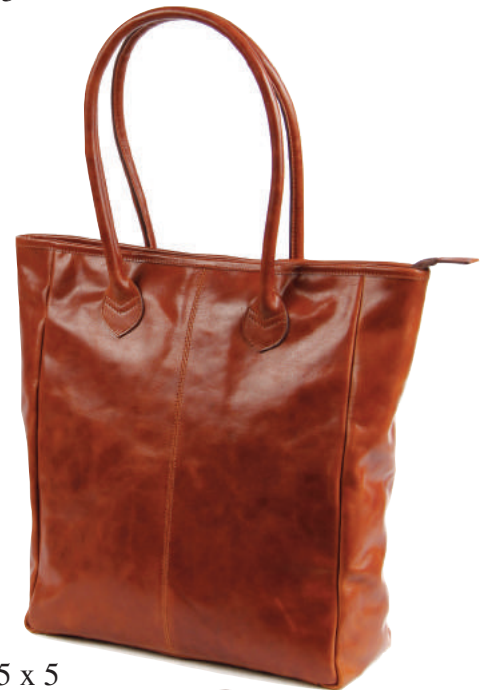
Large Ipad Tote Style # 759 Dimensions 15.5 x 12.5 x 5 $238.00 (a)