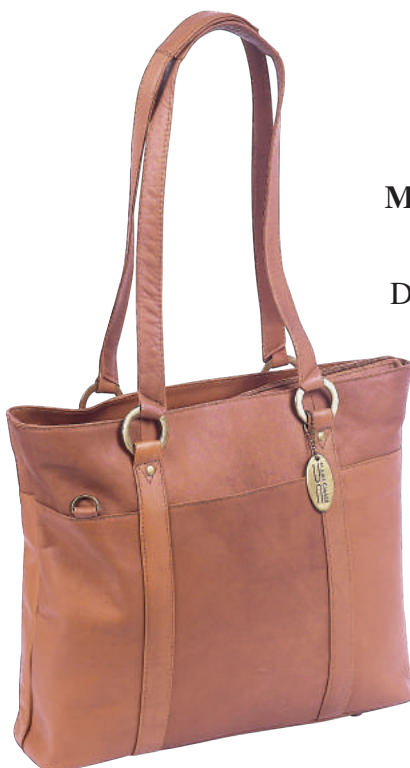
Milano Computer Bag Style # 795 Dimensions 14 x 13 x 4 $230.00 (a)