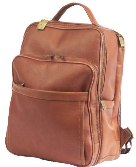
Tunica Back Pack