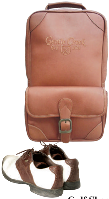
Golf Shoe Bag