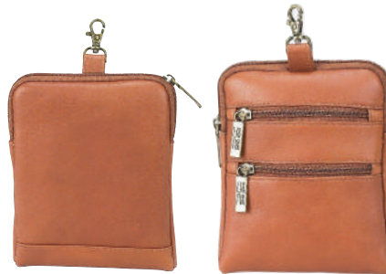
Luxury Ditty Bag